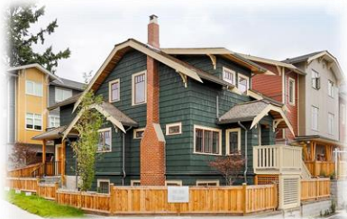
A Haraman project at Roderick Ave, Coquitlam

"Our experience with Haraman was fantastic from start to finish."