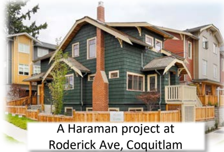
A Haraman project at Roderick Ave, Coquitlam